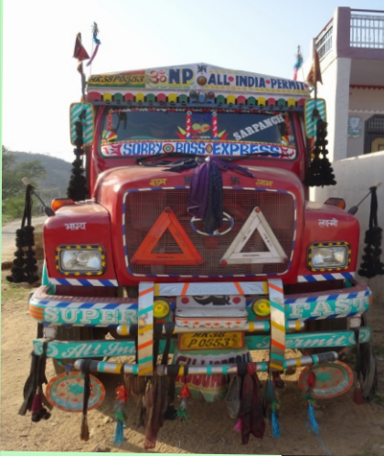
Manger-Banni Village Tour